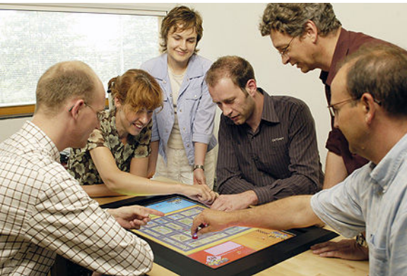
Figure 2: Philips Entertaible

Recent technological advances in user input tracking have enabled the construction of interactive tables that can now be commercialized. They enable the detection and tracking of multiple points of input, including complex shapes such as hand profiles, from multiple users simultaneously.