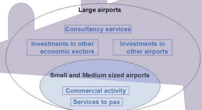
Figure III 2: Strategies of diversification by airport size