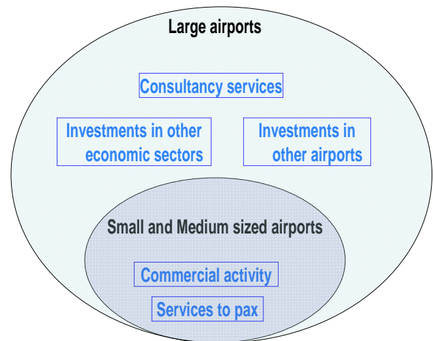
Figure 2: Strategies of diversification by airport size