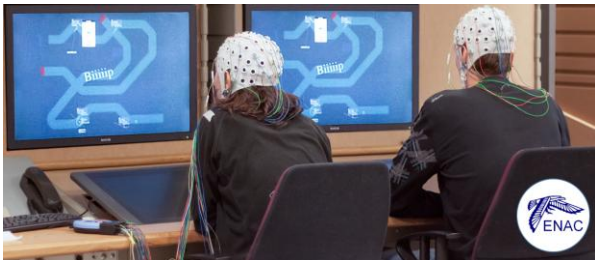
Figure 1. The LABY task, developed by ENAC