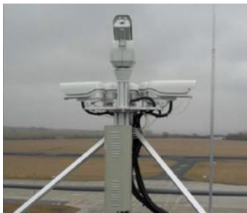
Figure 2: Mast with cameras for the Remote Tower concept.

Lowering costs: the RT project aims primarily to reduce operating costs and maintenance of small airfields. When the traffic density of an airfield is low, it is not profitable to maintain a control tower and its associated infrastructure.