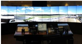
Figure 1: Typical Remote Tower room.

To maintain and improve safety and efficiency in ATC, the service providers need to constantly innovate with new systems and devices. The Remote Tower (RT) concept belongs to one of the most recent innovations [12]. The RT (Figure 1) fulfills ATC services from a location remote from the original control tower. A mast is deployed on the airfield with various sensors (cameras, radio antenna, etc.) and a video stream with additional information is transmitted to a remote site thanks to network communication systems. Many countries have started developing RTs to lower the building costs compared to actual tower and to provide ATC services in low-traffic or difficult-to-access aerodromes. In order to better understand the RT challenges, we summarize in the following the design requirements of this concept: