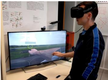
Figure 3: The immersive environment for the Remote Tower concept.

use thermal/infrared vision with virtual labels. Due to the low visibility, the ATCo turns on thermal vision to enhance the monitoring. This enables the controller to view the aircraft that is waiting at the holding point and the aircraft on final approach. The ATCo can additionally see the information displayed in the virtual labels that are linked to the aircraft. When the aircraft has landed and the ATCo confirms by the position of the labels that the landing was successful and it has passed the waiting aircraft, clearance for the waiting aircraft to line up on the runway is given. As the aircraft starts moving, the ATCo receives feedback of the action on the label. The thermal/infrared vision allows the controller to see when the runway is vacated and can give take-off clearance with no delay. Having thermal/infrared vision and virtual labels in a control tower can increase the ATCo's situational awareness, especially in low visibility. It is also beneficial for safety and efficiency concerns. However, if there are several aircraft near each other, the amount of labels could confuse the controller and cause dangerous situations.