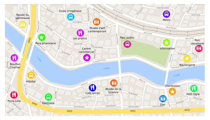
Figure 3. Map M2 (European-style map) used in the Indoor Study for Task 3, counter-balanced with M1

The study compared the usability of the Tactile and Spatial techniques when interacting with a floor-projected map. As