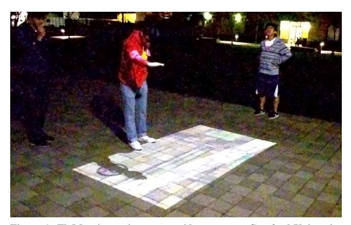
Figure 1. FlyMap in use in a tour guide context at Stanford University by a visitor defining what route to take using mid-air gestures.

done in the past decades to improve human-robot interaction. Yet, these interaction principles cannot simply be translated into flying robots (a.k.a drones).