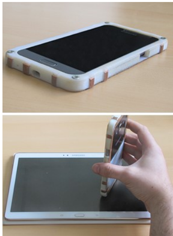
Figure 3: Copper-based case (top). Stacking of our prototype on the tablet screen (bottom).